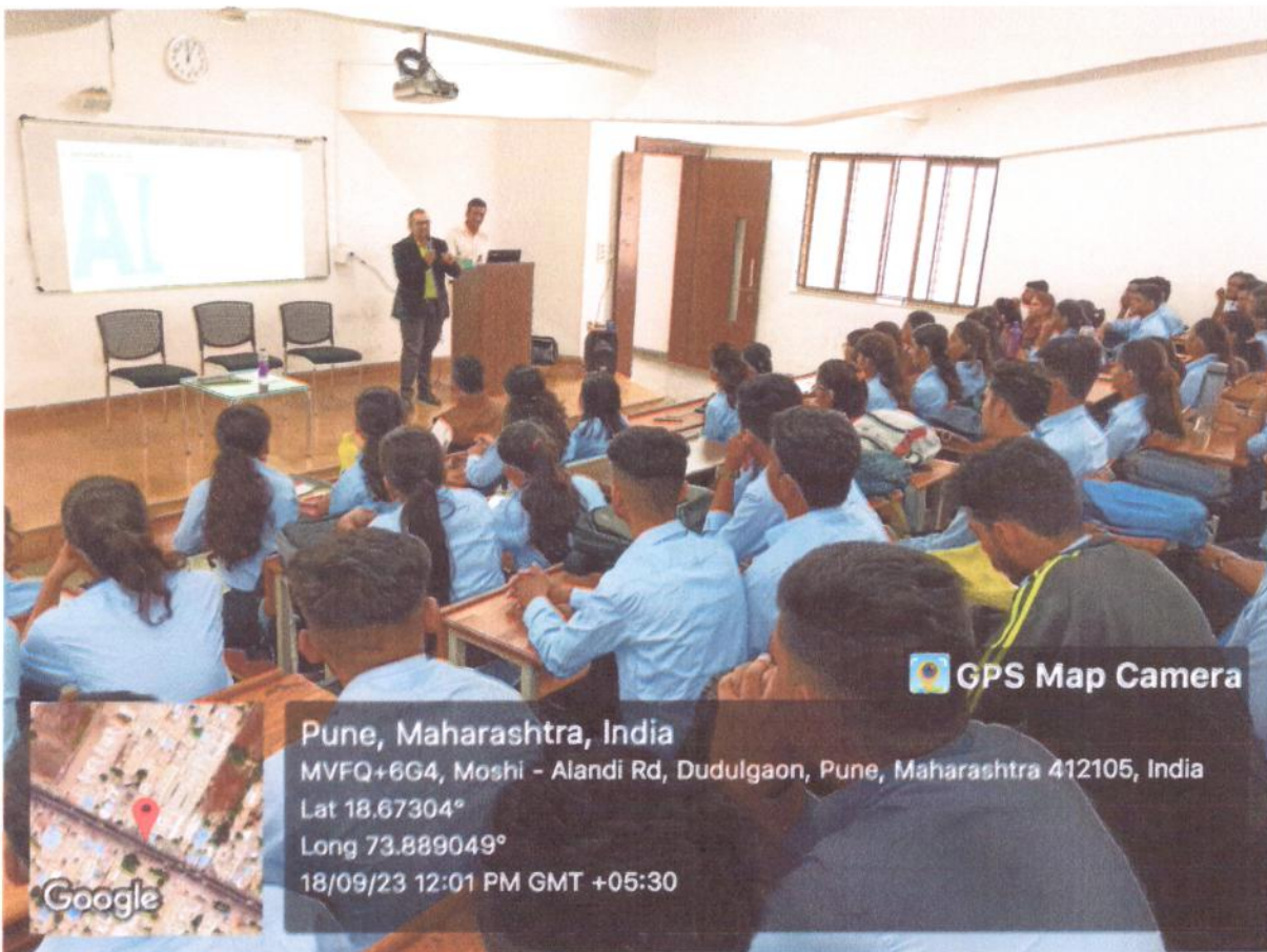
Guest Speaker Explaining the Concept of AI and ML